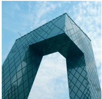
Image of CCTV building, Beijing: Richard Giles/Flickr Used under Creative Commons licence