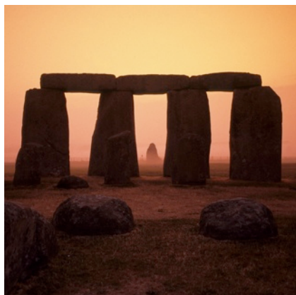
Image of Stonehenge: Wessex Archaeology/Flickr Used under Creative Commons licence